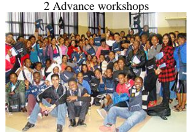
Phoenix community learning ambassadors.