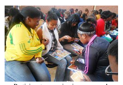
Participants engaging in group work during the Maths Edge workshop.