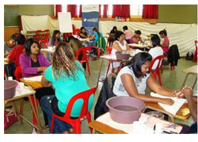
Participants in the Introduction to Manicure & Pedicure workshop engaging in practicals with each other.