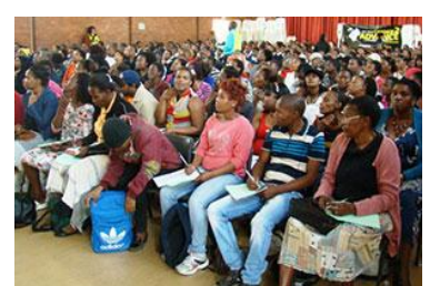
Some of the audience at Chance 2 Advance